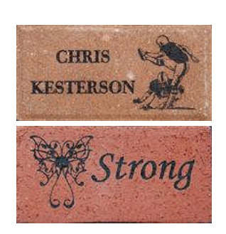
For just $100, you can create and display your own permanent 4"x8" paver brick (with or without clipart)

Want to celebrate the day you were made a Mason? Do it! Want to remember the day you retired from work? Do it! Want to celebrate your grandchildren? Do it! Want to remember a special loved one who is no longer with you? Do it! Just want to say something that touches your heart? By all means, DO IT!